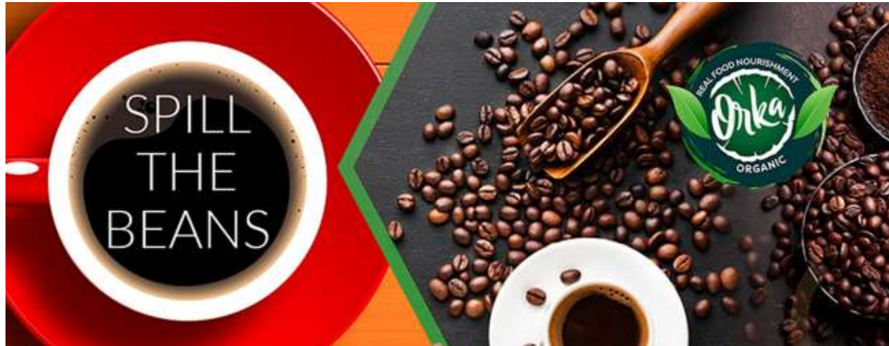
Website banner creative