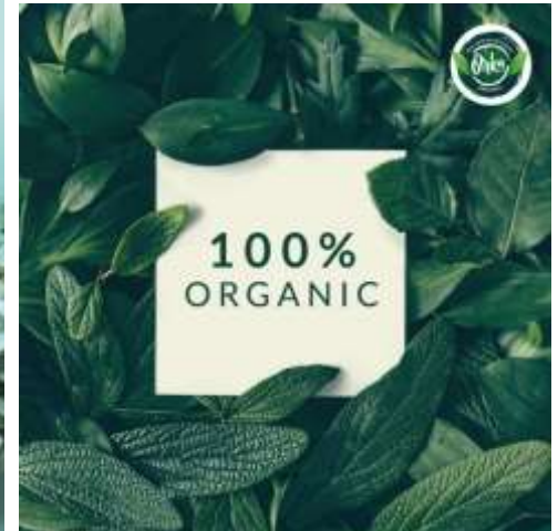
Digital media creative